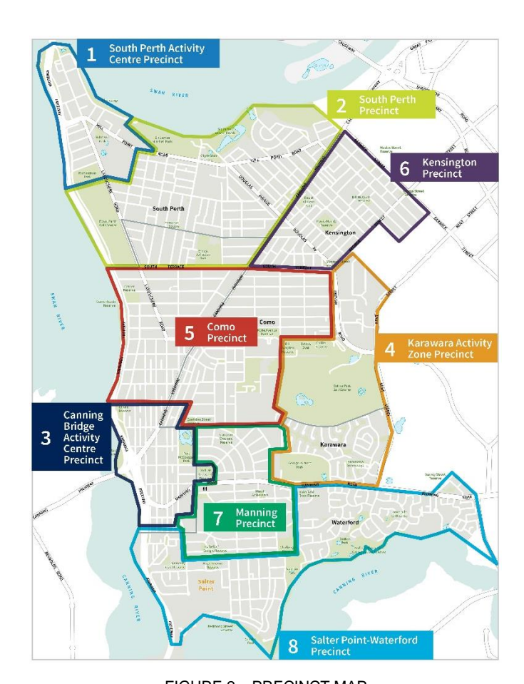
FIGURE 2 – PRECINCT MAP