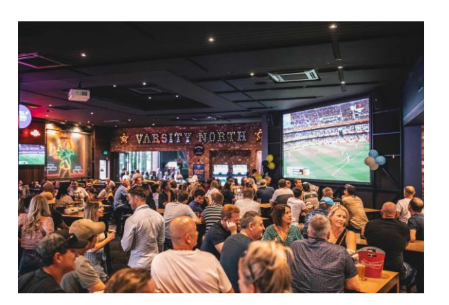
VARSITY BAR JOONDALUP

19. Varsity promises and delivers an inclusive, vibrant, fun and entertaining experience with something for everyone. All of the Varsity Venues are designed to appeal to all age groups, with the median age of patrons being 35 years.