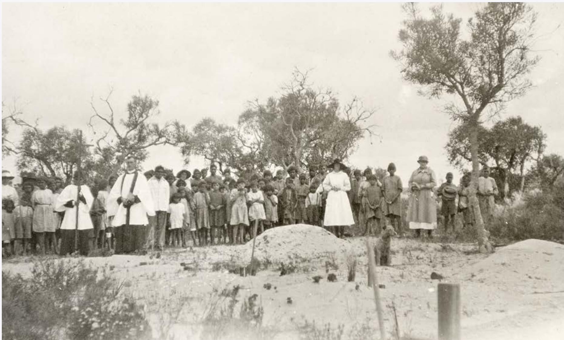
Congregation of mourners and clergy beside a grave at the cemetery. c1920 : Moore River W.A.