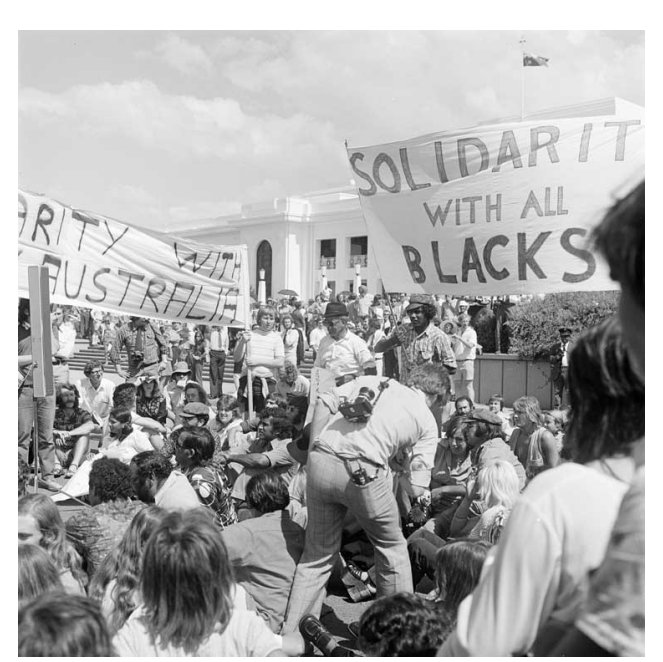
Demonstration in support of Aboriginal rights.

Oodgeroo Noonuccal, (Kath Walker), Minjerribah woman, 1970