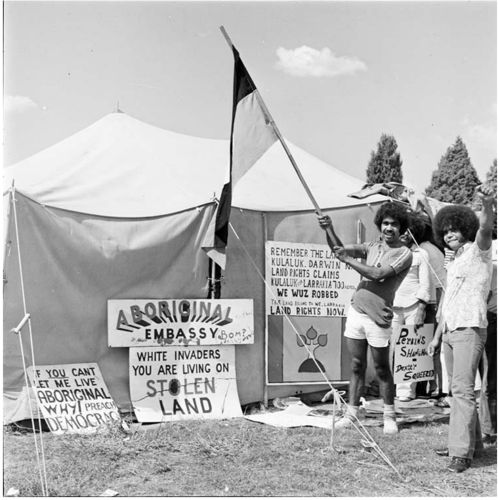
Image: Protestors at the Aboriginal Tent Embassy.

The Aboriginal Tent Embassy was established by activists on the lawns of Parliament House in Canberra on 26 January 1972, in response to the McMahon government's failure to recognise land rights. By 1992 the Embassy became a permanent fixture and remains there today. The image below depicts protestors at the Aboriginal Tent Embassy in 1974.