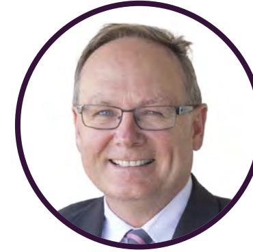
The Hon. Roger Cook MLA Premier of Western Australia

Congratulations to each of our newest State Cultural Treasures. On behalf of all Western Australians and the State Government, I thank you for your ongoing contribution to our community and acknowledge the lasting impact and legacy your career has had on our vibrant and creative state.